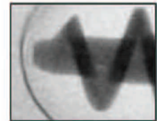
Continuously variable magnification from 4X to 20X

AUTOCLEAR is the leading worldwide producer of advanced, fast, reliable, X-ray, Weapons and Trace Detection screening systems. Visit us at www.autoclearus.com . Ask about our mobile, cargo, dual view and backscatter systems.